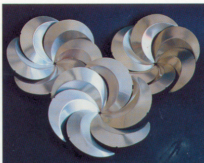
Goldsmiths Bursary award: 'Crease and fold' bowls